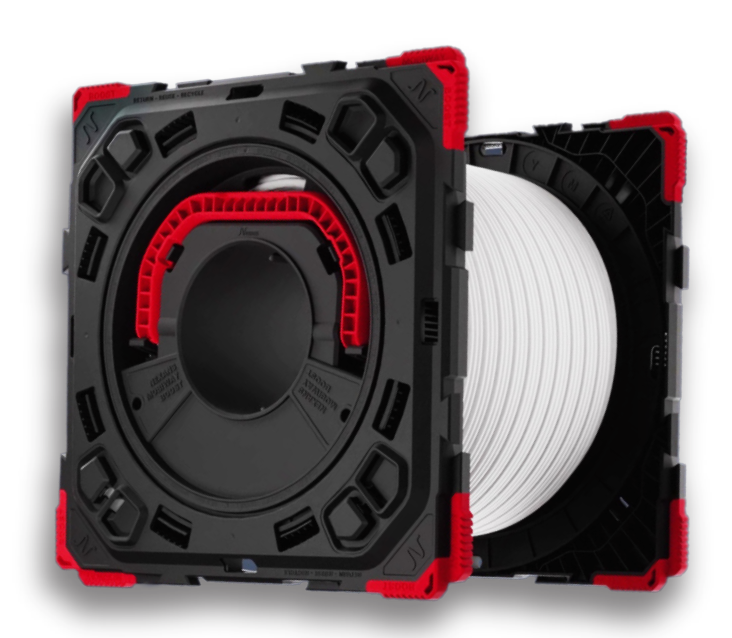
MOBIWAY BOOST comes with 1.5mm & 2.5mm 2core + earth flats and a robust new spool design to help you work smarter, faster, and safer.

MOBIWAY BOOST, a revolutionary cable spool management system that challenges a longstanding industry standard, addresses the inconveniences associated with traditional spools, offering seamless solutions. Designed with the user in mind, the inner drum within the cable spool ensures a safer unspooling and rewinding process, whereas its integrated handle provides convenient and ergonomic carrying, a feature which improves overall handling. MOBIWAY BOOST is an innovative spool system that revolutionizes cable installation, elevating efficiency and safety.